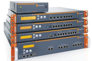
Astaro Hardware Appliances

Automatic firmware and pattern updates are provided via Astaro's Up2date service, included as part of every maintenance contract.