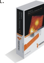
Astaro Software Appliance